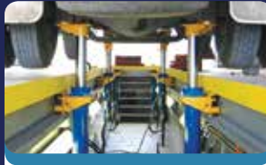
Hartex Pit Jacks